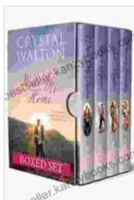
Image alt text: A collection of the "Home in You Boxed Set" products, including the book, workbook, labels, and storage boxes.

Click here to Free Download now: [Link to Free Download the boxed set]