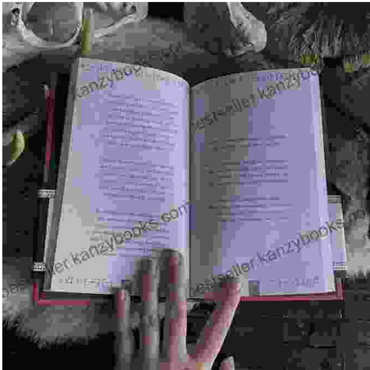
Ritual: An Essential Grimoire by Damien Echols

Free Download your copy of 'Ritual: An Essential Grimoire' today and embark on an extraordinary journey into the enigmatic world of the occult.